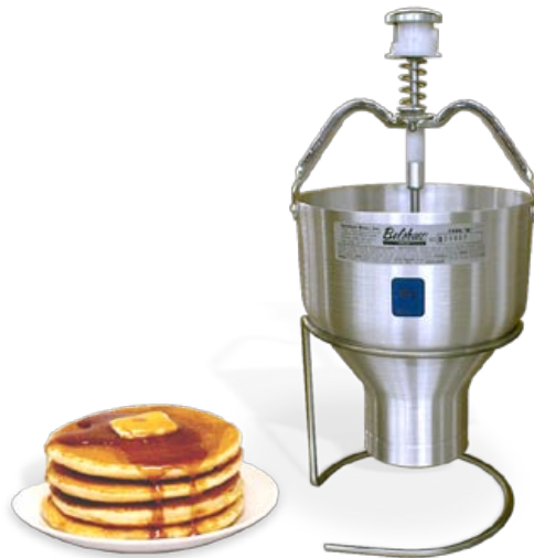
Type 'K' Pancake Dispenser