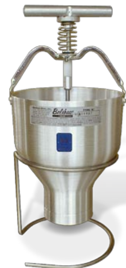
Type 'K' Donut Depositor/ Type 'K' Hushpuppy Depositor