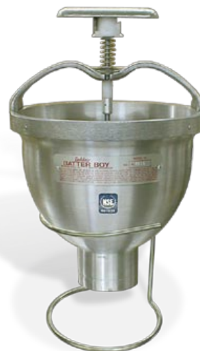
Type 'G' Batter Boy' Depositor