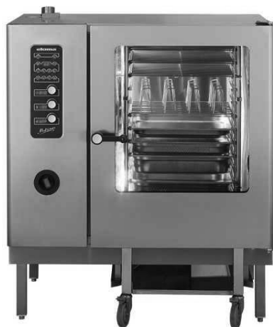
Multimax B 12-21